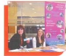
Representative from Swansea Council for Healthy Swansed