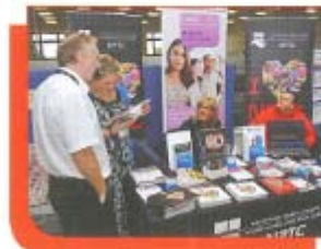
Representative for South PFA Tŷcwm Cwm