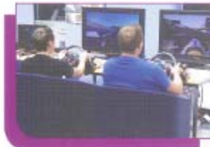
Staff used for DVLA's 'gaming' chess's games